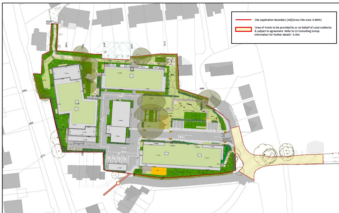
Figure 1.1: Extract of Proposed Site Layout Plan.

Pembroke Partnership Limited 1 have proposed a Strategic Housing Development (SHD) comprising 115 No. apartments (45 No. 1-bedroom units and 70 No. 2-bedroom units) on a c. 0.9-hectare site adjacent to the Green LUAS Line to the north of Dundrum Town Centre in Dublin 14. The proposed development will be located within the existing two-storey 'Frankfort Castle' and within 3 No. new blocks (Blocks A, B, C) ranging in height from three to five-storeys. A 2 No. level basement is also proposed below Block A. Additional development includes residential amenity areas, crèche (c. 80 sq. m – 20 No. spaces) and hard/soft landscaping.